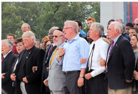
Pastors and evangelical leaders of every faith, including Imams, lock arms at Glenn Beck's 8/28 rally at the Lincoln Memorial last August.

"By the way, if that hasn't hit you yet, the country is failing. We're supposed to figure out what it was [the Founders] were trying to do. It's up to you to do your homework. It's up to you to read history. It's up to you to read their blueprint in life. What was their blueprint? Moses was their blueprint. Moses was such an important figure to the Founders. His images were everywhere.