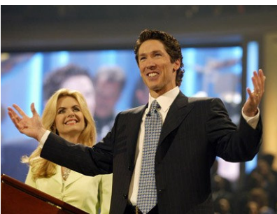
"I just found out that Crest is discontinuing my favorite style of whitening strips. Praise the Lord!"