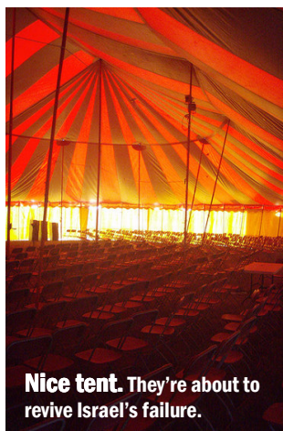
Nice tent. They're about to revive Israel's failure.

failed. It began in glory and ended with James killed, Peter exiled, Jerusalem starved, and the Jews scattered. This administration was meant to fail. Why? It was another demonstration of Israel's stubbornness. Apparently, stubbornness dies hard. ■