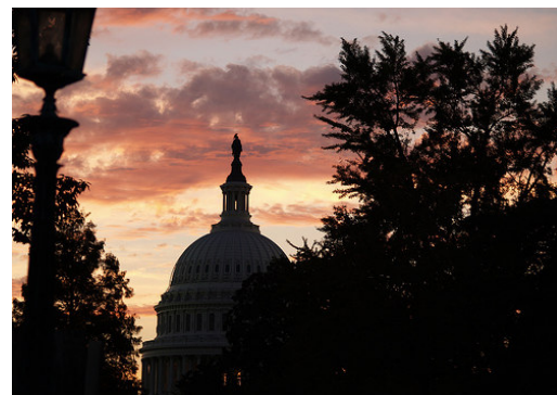
A dim, dim, dim analogy

Thus also in Christ. When our bodies are changed, we will all be immortalized. This is because we are all members of the body of Christ. In my United States analogy, this answers to all of us being citizens of the United States. As members of the body of Christ, we all have a celestial destiny and all enjoy the benefits of being "in Christ." However. Among this select class, there are select classes; the people do not elect these—God does. Stay calm; what I am about to say may not seem politically correct.