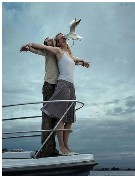
Well? You're on the frickin' Titanic , people.

On the Titanic, the band played on. This must be you. Live your life. Keep playing music. Talk to God more than ever. Christ is our Rescuer out of the coming indignation (1 Thess. 1:10). The day of your change is near. ■