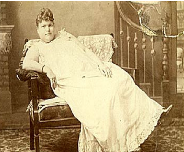
She be disqualified