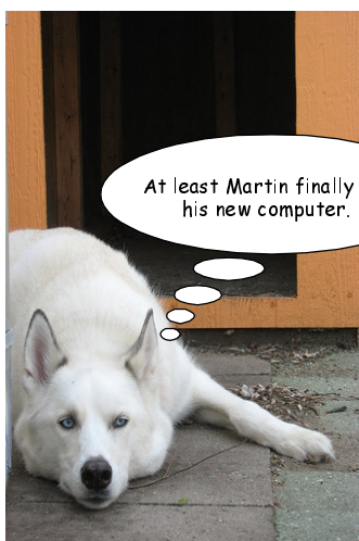
Insert your photo here.

“The world can not be hating you, yet Me it is hating, for I am testifying concerning it that its acts are wicked” (Jn. 7:7). How can I love a system that hates Christ? Why