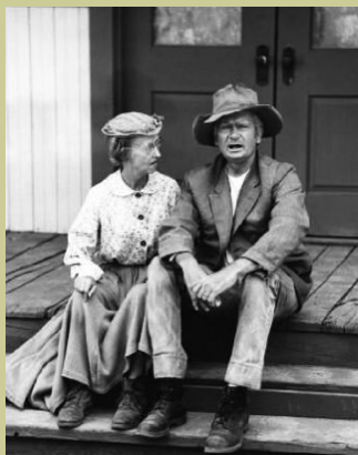
"Dad gum it, Granny. I jumped up, but I come back down."