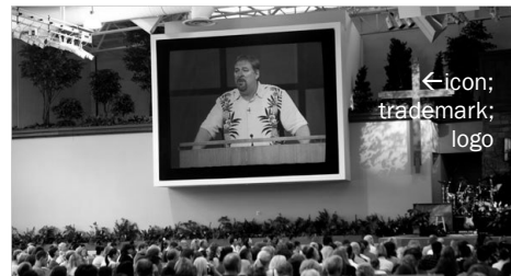
Rick Warren at the Saddleback megachurch in Lake Forest, California. Crossless. Clueless.

When our Lord died, God rent the veil at the temple that separated mankind from Himself. The priesthood, undaunted, sewed that veil back together. This brings us to the Christian religion. Our Lord did away with the flesh of man, taking the old humanity to the tomb and rising without it. The Christian religion, undaunted, has resurrected the old humanity and now seeks to reform it with self-indulgent (they call it "self-denying") devotion and religious exercise.