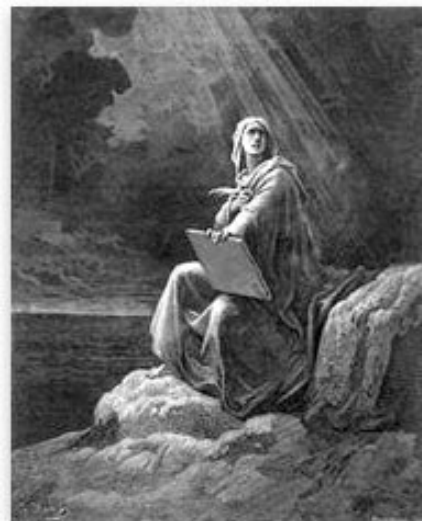
Saint John at Patmos by Gustave Doré

God has set apart three “days,” during which He operates and reveals Himself among men. These days are: 1) the day of man, 2) the day of the Lord, and 3) the day of God.