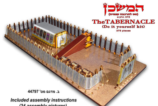
44797 מודל תב. כ. Included assembly instructions (34 assembly pictures). Design P. N° 44797