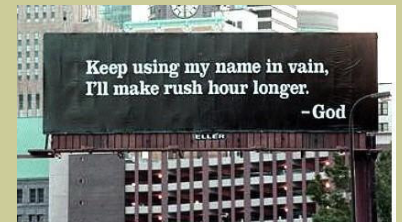
I guess God is a petty, impetuous brat.

Cigarettes are expensive, yes, but what is a person’s peace of mind worth? ■