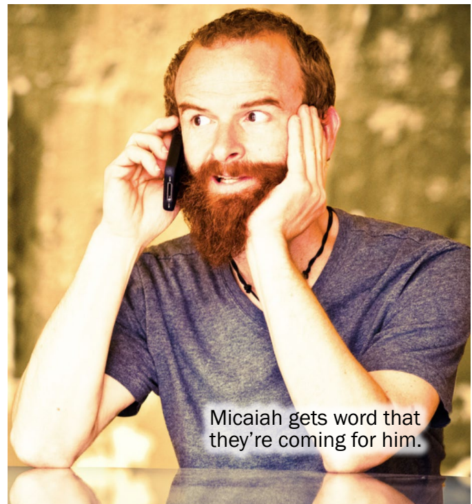
Micaiah gets word that they're coming for him.

Then the messenger who went to summon Micaiah spoke to him saying, "Behold now, the words of the prophets are