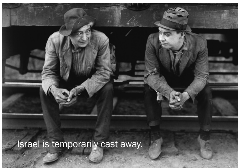
Israel is temporarily cast away.

In Acts chapter nine, as you know, the glorified Christ apprehended a Pharisee named Saul on the road to Damascus. This man's name was later changed to "Paul" to accord with his new career (his name means "pause"). The man would dispense spiritual blessing to the nations, apart from Israel during the God-inspired pause in their national aspirations. This event marked the beginning of a new administration of God that was not only apart from the kingdom of heaven that had been proclaimed in Jerusalem, but that was actually dependent on its rejection.