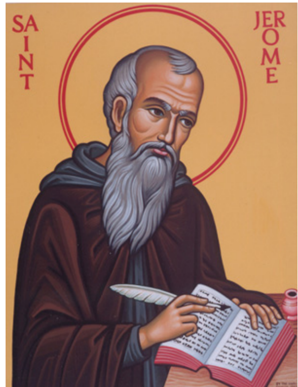
Thanks a lot for the Vulgate. Moron.

It is this word ( athanasia ), not the words aion or aionion that speaks of eternal life. These other two words always have to do with time. Never in all Scripture is the Greek word athanasia used to describe death, punishment, or separation from God. God was very careful