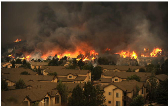
Approximately one mile from our apartment. July 26, 2012; our one-year anniversary.

The now-infamous Colorado Springs wildfire of 2012 touched down 300 yards from our apartment. I wrote on Facebook about our evacuation—the smoke, the red wind