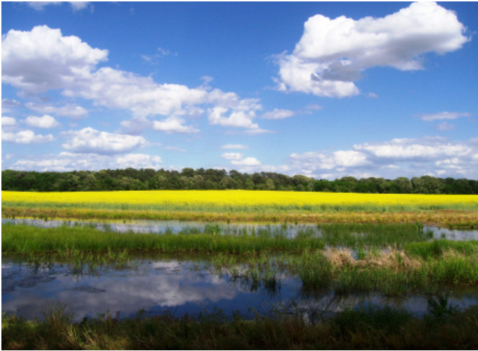
It will be said, “This was the site of New York City.”

The 3 1/2 years (Revelation 13:5) is a coming crisis few can imagine, and even fewer can believe. Our Adversary wants the saints asleep, and has deceived even the ranks of the saved with teachings such as Preterism—which claims that the events of Revelation have already occurred—and the doctrines of mainstream Christianity, which claim that only they will escape the impending fury. (The truth is they will be consumed by it.)