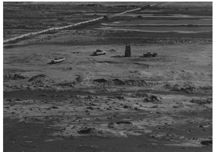
But first, New York City must (and will) look like this .

This window of grace will close, giving way to the presence of the Son of Mankind. Paul predicts it (Romans 11:25), John describes it (Revelation 8, 9), and Peter explains why we’re asleep to it (2 Peter 3:3-6). All are saved at the Consummation, yes (1 Corinthians 15:28), but we are far from that eonian end-point.