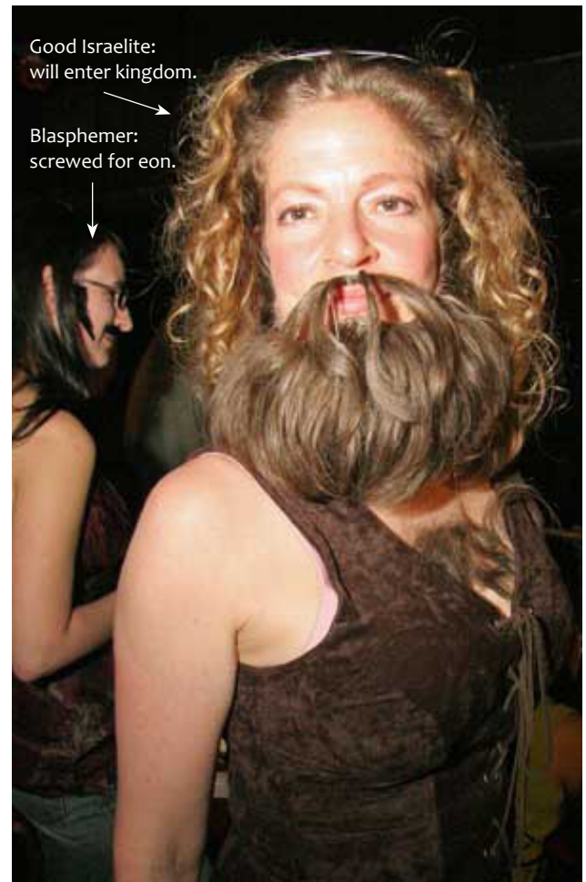
Every good Israelite ate, breathed, and slept the coming kingdom.

Once the 1,000 years conclude, there is to be a new heavens and a new earth (Revelation 21:1). This is the eon that will follow the Millennium. Paul calls it "the eon of the eons" (Ephesians 3:21). Those spirit-blasphemers whose names are not written in the book of life (the great white throne judg-